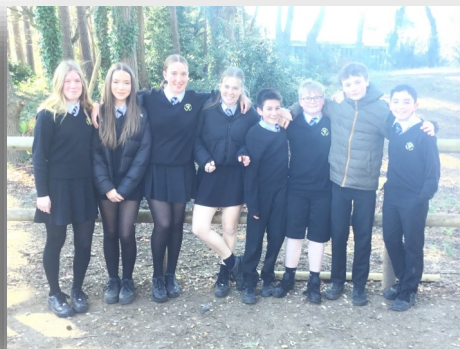
Year 8 Best Song The Recycling Bins