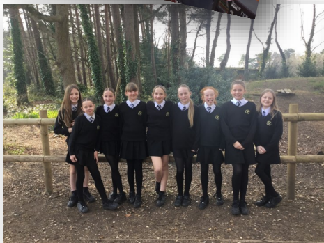
Year 7 Winners Galfornia