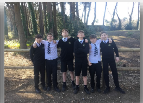
Year 8 Best Crowd Pleaser Bacon, Eggs and Cheese