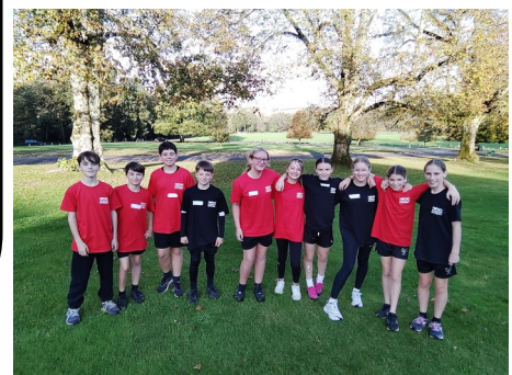
Our sports leaders

Last Friday, we hosted an afternoon of dodgeball with Parkstone Grammar, Emmanuel, and Lockyer's schools. The first KS3 girls' tournament was filled with intense and competitive matches that kept the referees on their toes! Both Year 7 and Year 8 teams finished in second place, demonstrating fantastic teamwork and determination. We're looking forward to the boys' teams taking the field after half term!