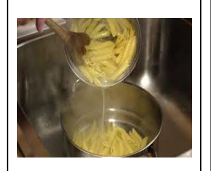
5. When ready, drain your pasta down the plughole with a colander, then run cold water over the pasta.