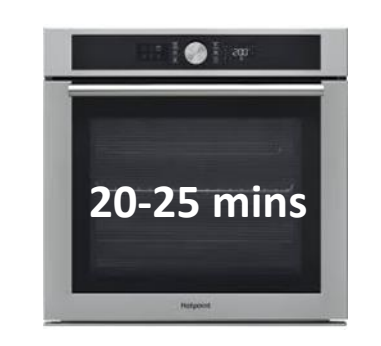
9. Place on a baking tray and bake for 20 minutes or until springy. Wash up.