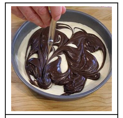
8. Swirl your cake mixture to make the marble effect.