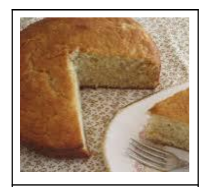
10. Gently lift out the cake when it is spongy and bounces to the touch.