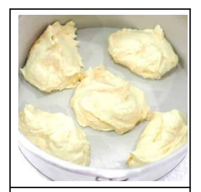
6. Add half the mixture into the lined cake tin in spaced out blobs.