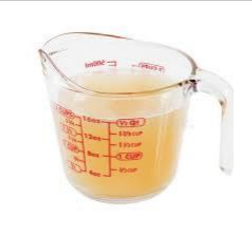
4. Crush your stock cube into a jug and make 125ml of stock with boiling water.