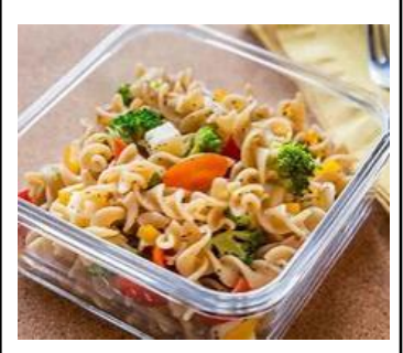
6. Add the cold pasta and chopped salad ingredients to your container,