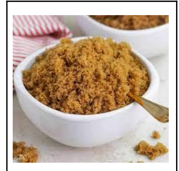
8. Sprinkle the mixture with brown sugar. (school provides)