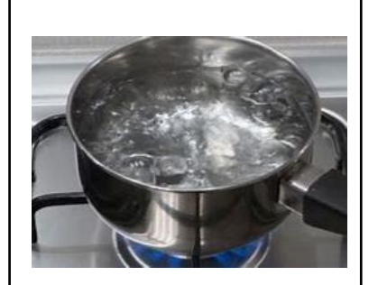
1. Add ½ a pan of hot water to a large saucepan and set to heat 6.