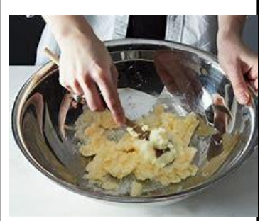
2. In a large bowl, cream the butter and sugar until pale and fluffy.