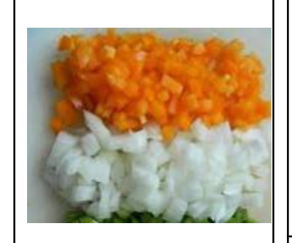
3. Dice and onion and chop the pepper into small pieces and place on your board.