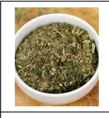
7. Add any herbs or seasoning.