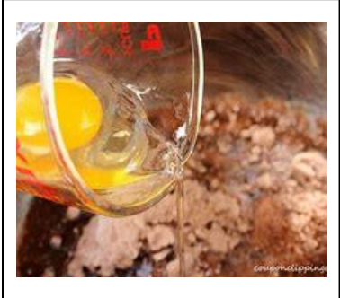
4. Add the egg a little at a time and mix in thoroughly.