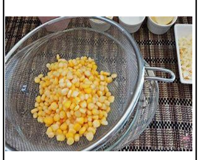
4. If you need to drain your sweetcorn, use a sieve over the sink.