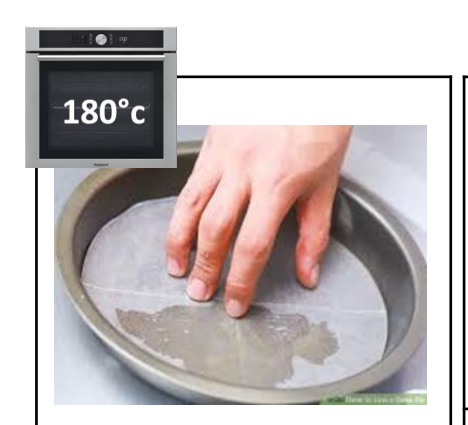
1. Set the oven and line the cake tin.

50g self raising flour 1 banana (soft/brown) 30g dried fruit (eg raisins, chopped apricots) 25g oats