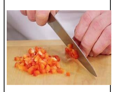
3. Whilst the pasta boils, cut your salad ingredients up evenly.