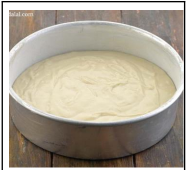
7. Spread the mixture into the lined cake tin.