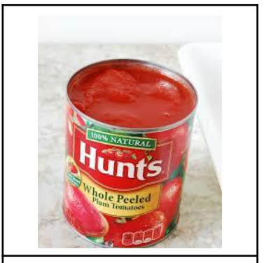
1. Open the tin of tomatoes