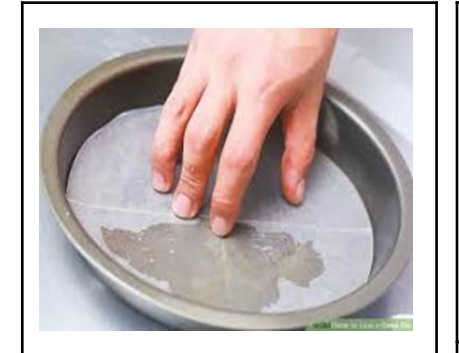
1. Set the oven and line the cake tin.