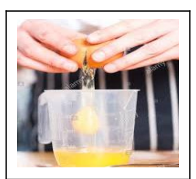
3. Crack the egg into a jug and whisk up with a fork.