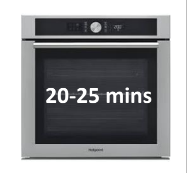
Place on a baking tray and bake for 20-25 minutes or until springy.