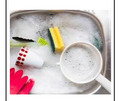
8. Wash up