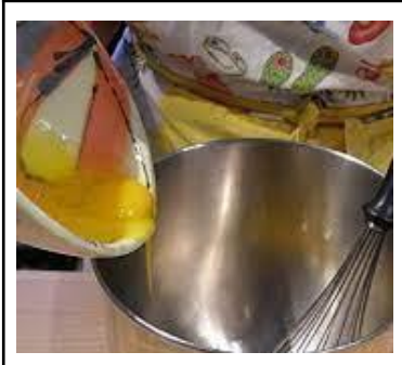
4. Add the egg a bit at a time and mix in thoroughly.