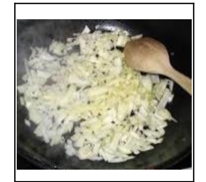
5. Sauté the onion and pepper for 5 minutes in a pan on heat 4 or 5.