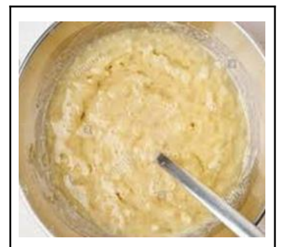
6. Mash the banana in a small bowl. Stir this into the mixture. Add the dried fruit and oats and combine.