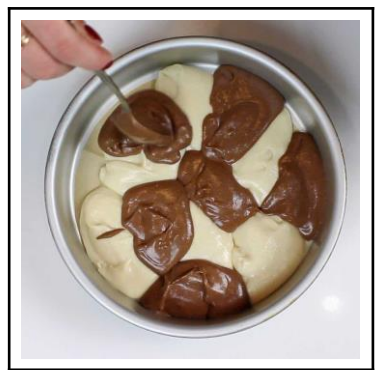
7. Add the cocoa powder to the bowl and mix. Add the chocolate mixture to your cake tin.