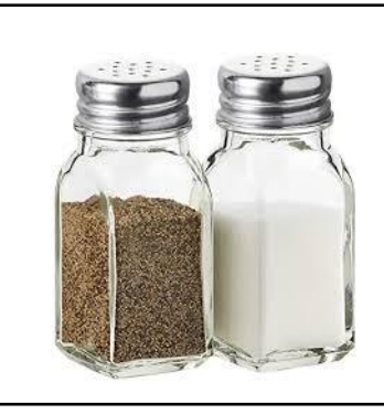
9. Season your sauce and turn off the heat. Transfer your sauce to your box.