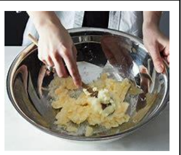
2. In a large bowl, cream the butter and sugar until pale and fluffy.