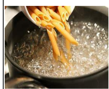
2. When the water boils, add the pasta and cook for 10minutes or until soft.